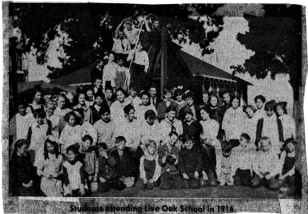
Students attending Live Oak School in 1916.