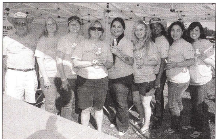
Join the VOLUNTEER TEAM!

Poetic Cellars, Santa Cruz Mountain Vineyard, and – joining us for the first time – 37th Parallel Winery, Mica Cellars, MJA Vineyards, and Wargin Wines. You'll want to taste them all, so plan on coming to the Festival both Saturday and Sunday.