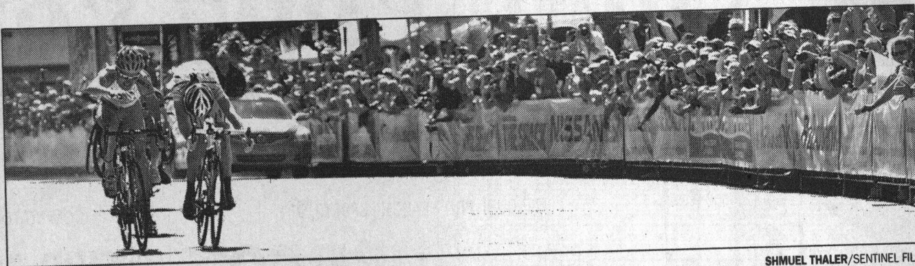
Beach Street in front of the Santa Cruz Beach Boardwalk is filled with spectators as David Zabriskie beats out Michael Rogers in a photo finish at the end of Stage 3 of the Amgen Tour of California in May 2010.