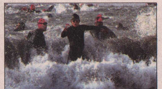
A competitor looks back to shore after being battered by a large wave upon entering the surf.

■ Send us your stories, photos and videos at WWW.YOURSANTACRUZSPORTS.COM