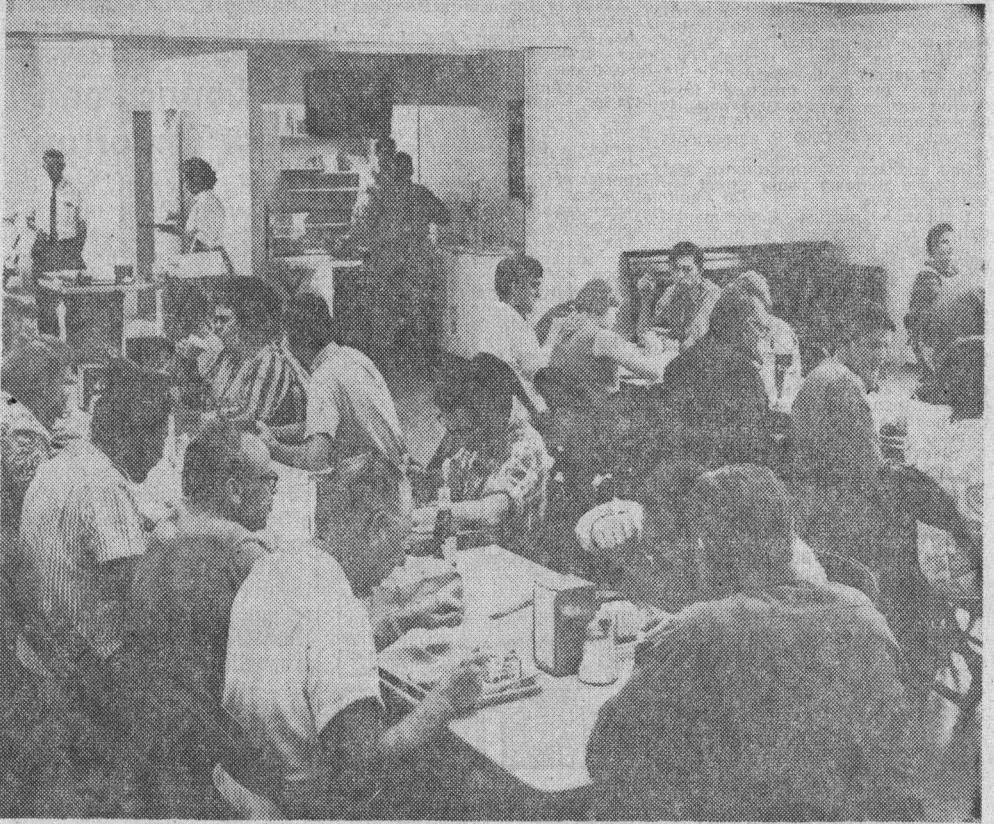
Goodwill workers receive full meals at the plant for 50 cents. They enjoy coffee break snacks as in a regular industrial plant. The cafeteria is marked for expansion.