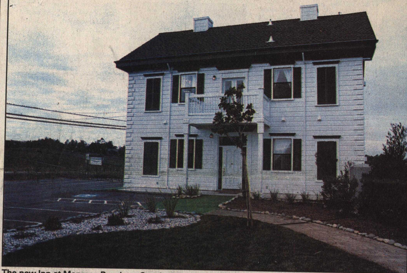
The new Inn at Manresa Beach on San Andreas Road was fashioned from the old Thurwachter House.