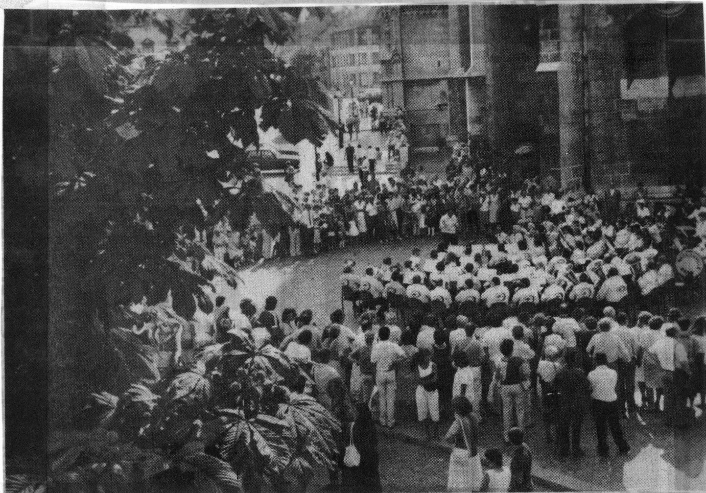
Band played for audiences everywhere, including this castle courtyard in Badgastein, Austria.

APTOS BRANCH LIBRARY 7695 Soquel Drive Aptos, California 95003