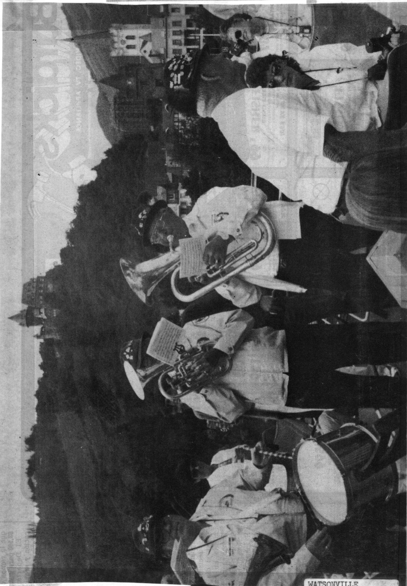
Feeling right at home during Rhine cruise, band members tootled away with some oom-pah-pah music in the tradition of German bands.

WATSONVILLE REGISTER-PAJARONIAN July 18, 1985