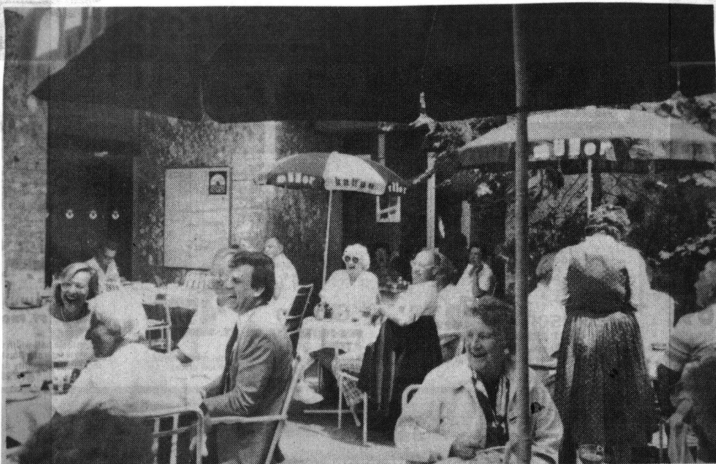
Outdoor-cafe lunches in cities like Vienna were part of trip's attractions.