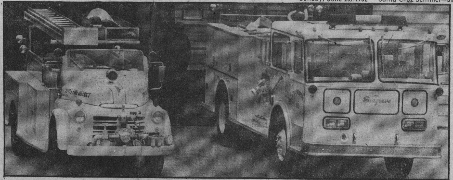
Aptos Fire District's newest pumper stands beside its first, a 1948 Dodge