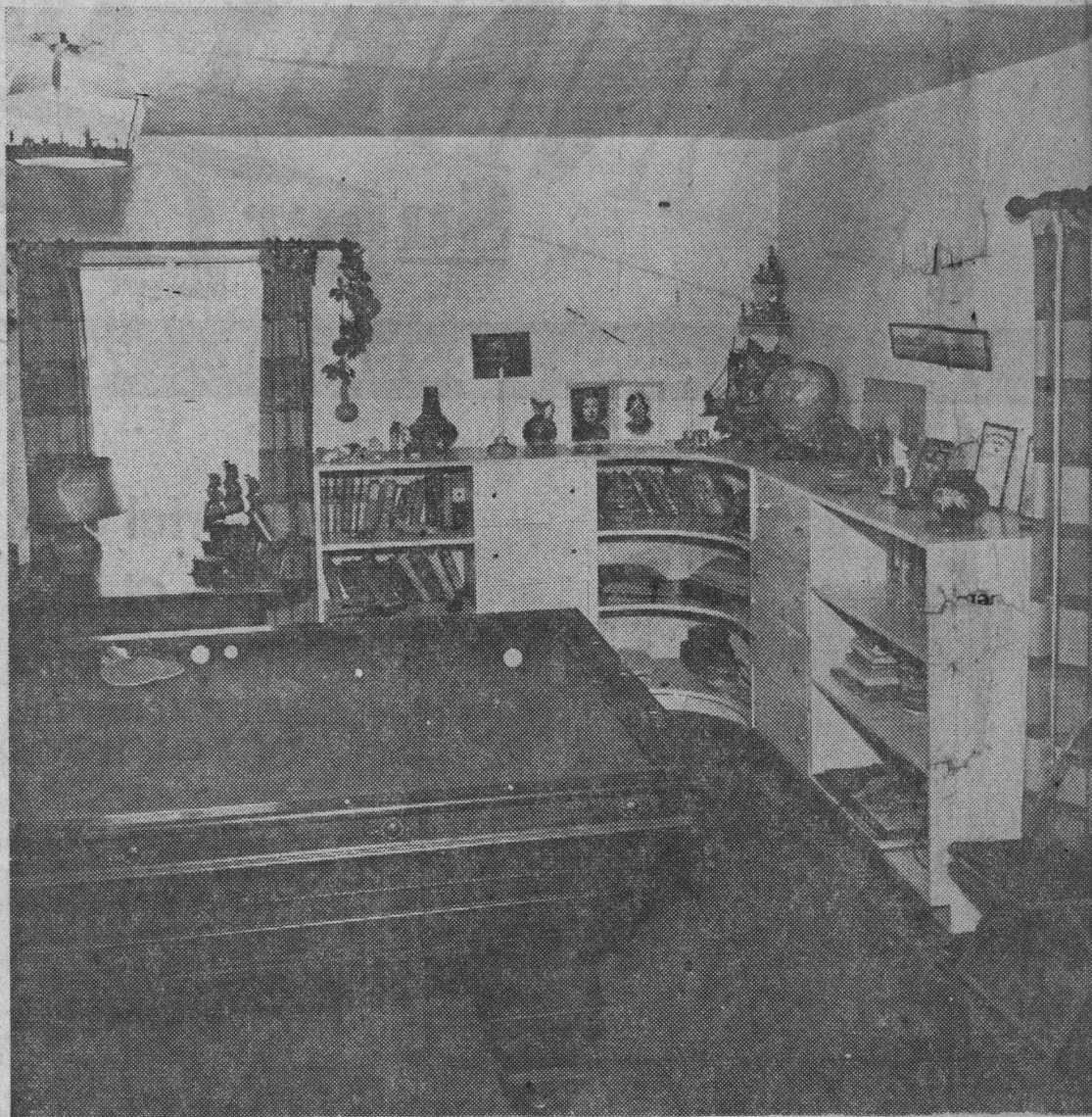
The large game room, pictured above, is located over the at-

tached garage at the front of the residence, and is at a lower level