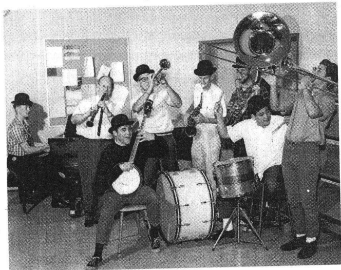
The first jazz band at Cabrillo, circa 1959. The jazz program went on to become one of the finest in Northern California.