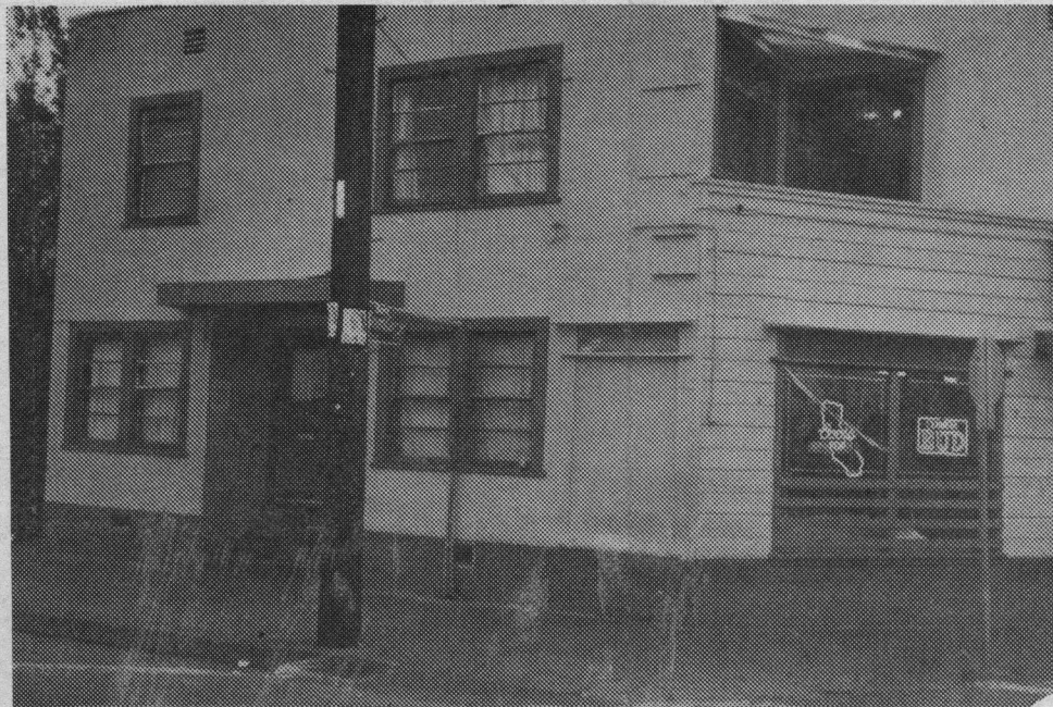
SANTA CRUZ — The market center, which will benefit from the Campaign for Human Development grant, will be situated on the corner of Leibrandt and Riverside Streets.

Technical advice is being supplied by the Santa Cruz Community Housing Corp. The SCCHC was formed in 1986 and is patterned after CHISPA in Salinas. Over the years, CHISPA has supplied a broad range of financial, organizational and training services to many low-income housing projects in the Salinas Valley which have been supported by national grants from the Campaign for Human Development, such as San Jerardo, La Buena Esperanza, Las Casas de Madera, Vista de la Terraza and Primavera.