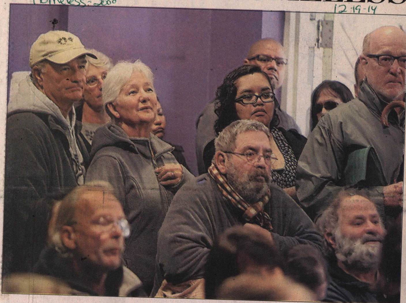
The Homeless Services Center annual memorial for homeless who died during the past year drew a standing-room-only crowd Thursday.