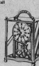
Model 511277 8" tall