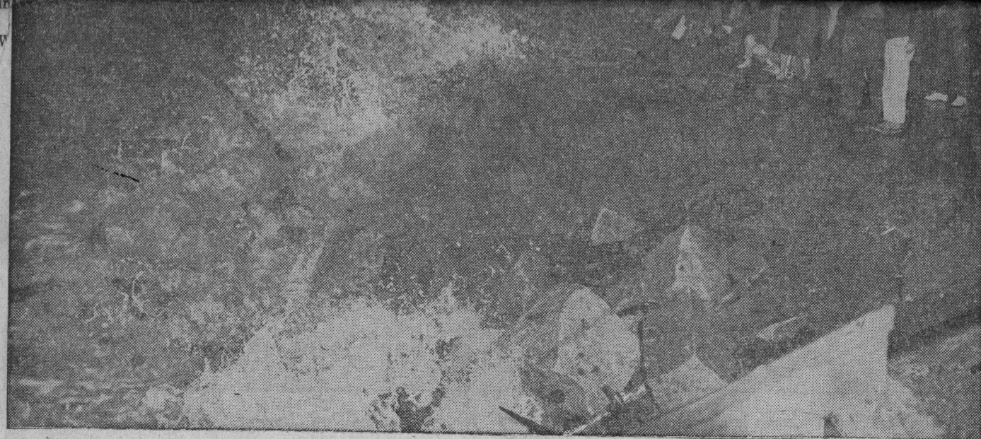
Spectators dash for safety as one of last night's huge breakers crashes over Cowell beach onto the street. Hundreds of

sightseers were on hand at the edge of the municipal wharf to watch the spectacular waves at work.