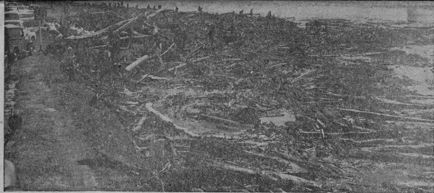
The sand on Twin Lakes beach was almost totally obscured yesterday as logs and driftwood and human wood seekers jammed the beach. The debris was carried down the San

sightseers were on hand at the edge of the municipal wharf to watch the spectacular waves at work.