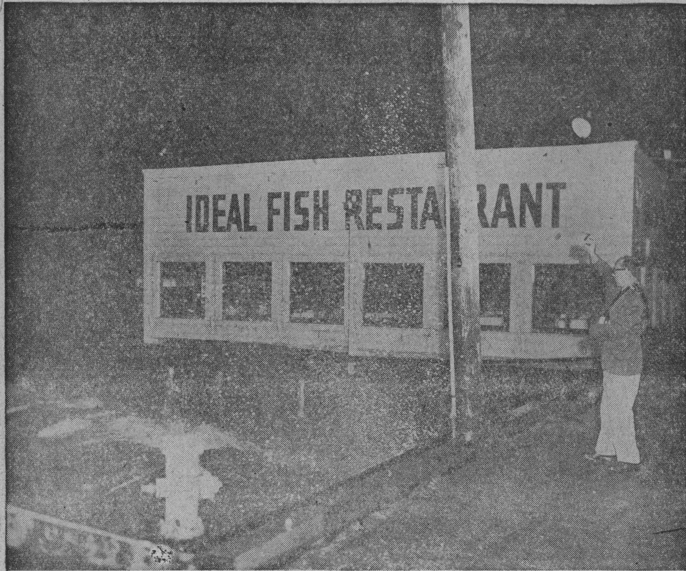
The Ideal Fish restaurant at the foot of municipal wharf almost became the home of living fish last night as heavy waves smashed at its moorings and splashed against windows. Two windows were later broken in the row showing in this

picture while others were cracked along the Cowell's beach side of the restaurant. Standing by at right is Sentinel Managing Editor Gordon Sinclair.