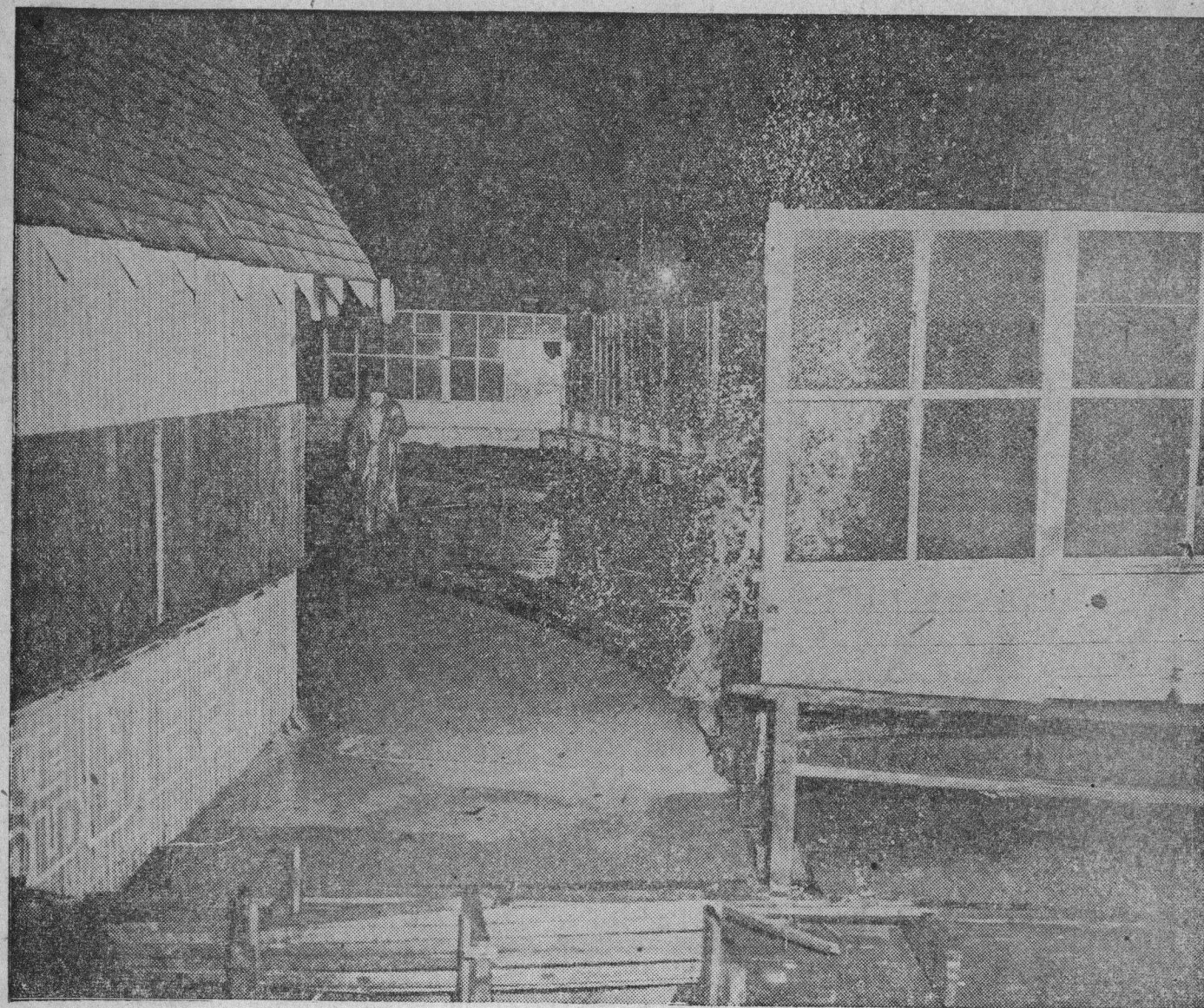
Spray crashed through the boardwalk behind the Esplanade at Capitola during some of last night's heavy tidal action. Capitola's amusement area suffered heavy damage, estimated

municipal wharf just beyond the gate. Note the type of the wave to the right of the fire hydrant.