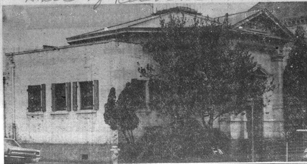
Hall of Records