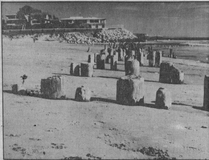
TWIN LAKES BEACH: exposed piling (left) from Santa Cruz-Capitola street car system; photo taken at low tide, March

area too shallow and they were torn down. Ships then used the present Municipality Wharf, but again the sand made this harbor unusable. The last freighter tied up to the wharf in 1936, said Skip.