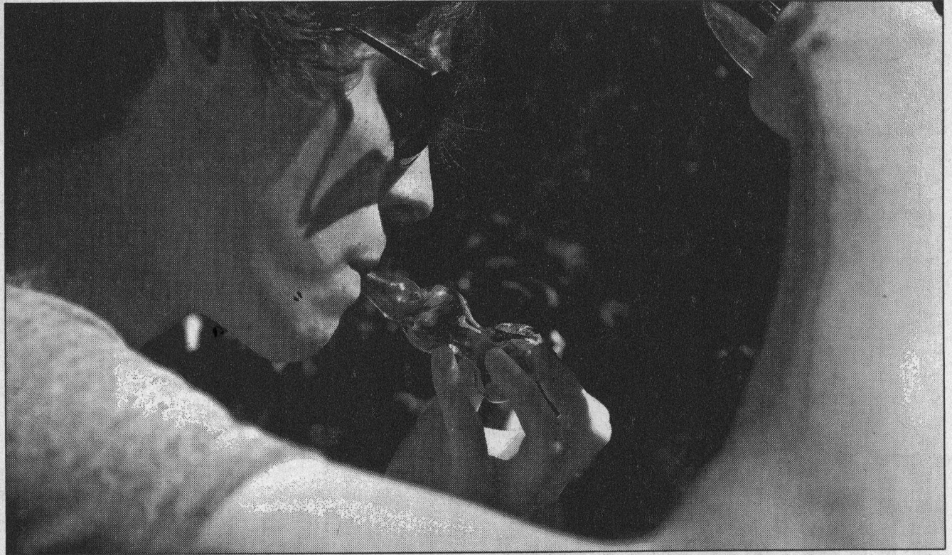
The sun was shining strong enough for a smoker to light his pipe using a magnifying glass at Porter Meadow on UC Santa Cruz Campus Friday.