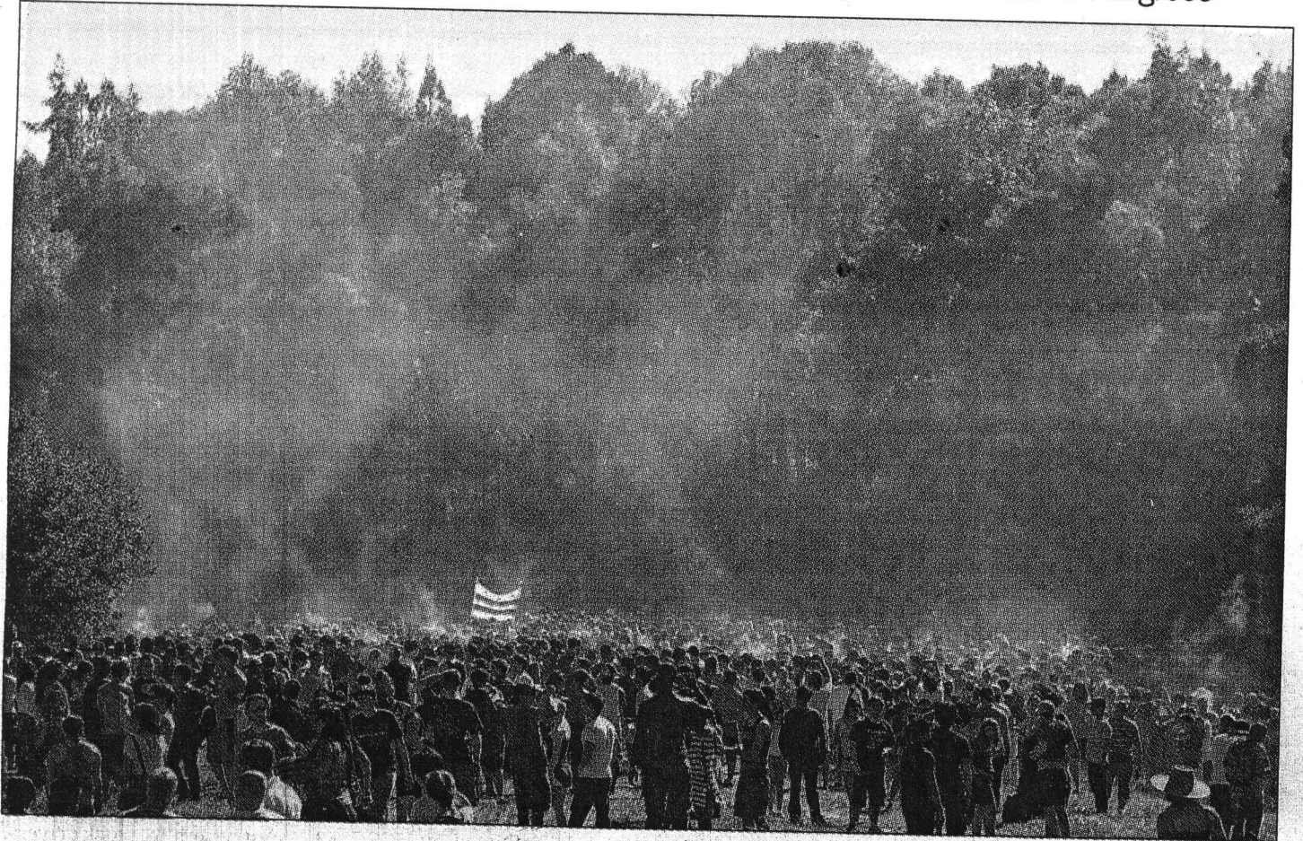
As the clock strikes 4:20 p.m. a collective puff of smoke fills the air above Porter Meadow on UC Santa Cruz campus on Friday.

Annual celebration of marijuana lights up UCSC as temperatures reach 84 degrees