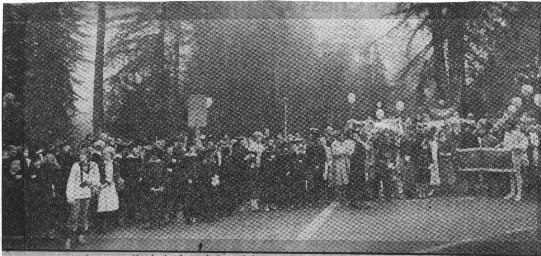
Hundreds of people braved the rain to participate in the dedication