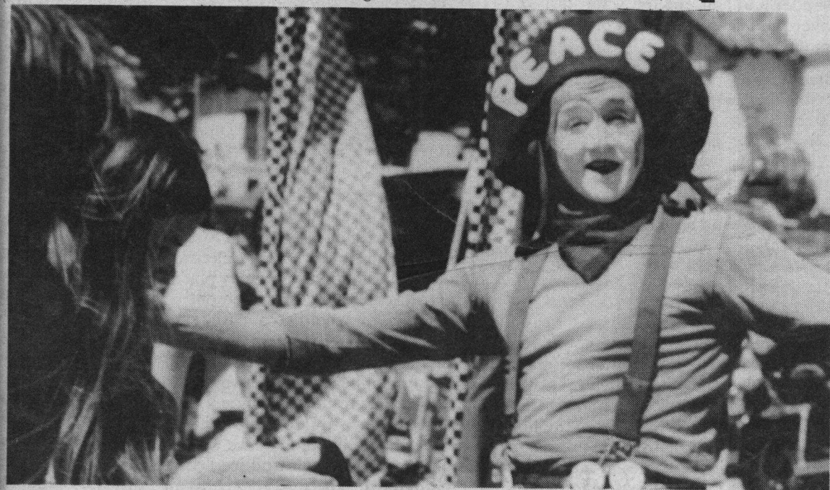
PEACE DAY: Discovering Our Common Ground.

For more information regarding Peace Day, telephone the Peace Day Project at 475-0207. □