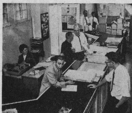
Planning and Public Works, Note Secretary and Desk in Aisle. Time Waiting, Costly.

Through MEASURE "B" the congestion of City office functions will be relieved with resultant efficiency. We now waste the time of our best people in city quarters which are split apart and jammed at that. The space which was adequate 30 years ago is wasting our time and money today. A ground - level addition in back of City Hall is the answer. The expansion will cost $300,000, to be paid from current revenues.