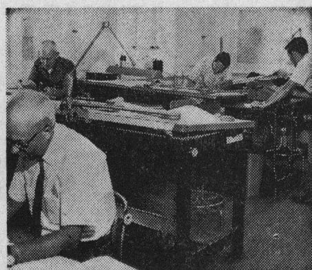
Engineering Staff is Elbow to Elbow. Inspection Services Housed in Auditorium.

Through MEASURE "B" the congestion of City office functions will be relieved with resultant efficiency. We now waste the time of our best people in city quarters which are split apart and jammed at that. The space which was adequate 30 years ago is wasting our time and money today. A ground - level addition in back of City Hall is the answer. The expansion will cost $300,000, to be paid from current revenues.