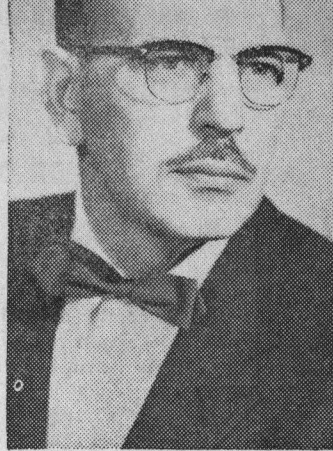
NORMAN A. WALTERS Mayor, City of Santa Cruz