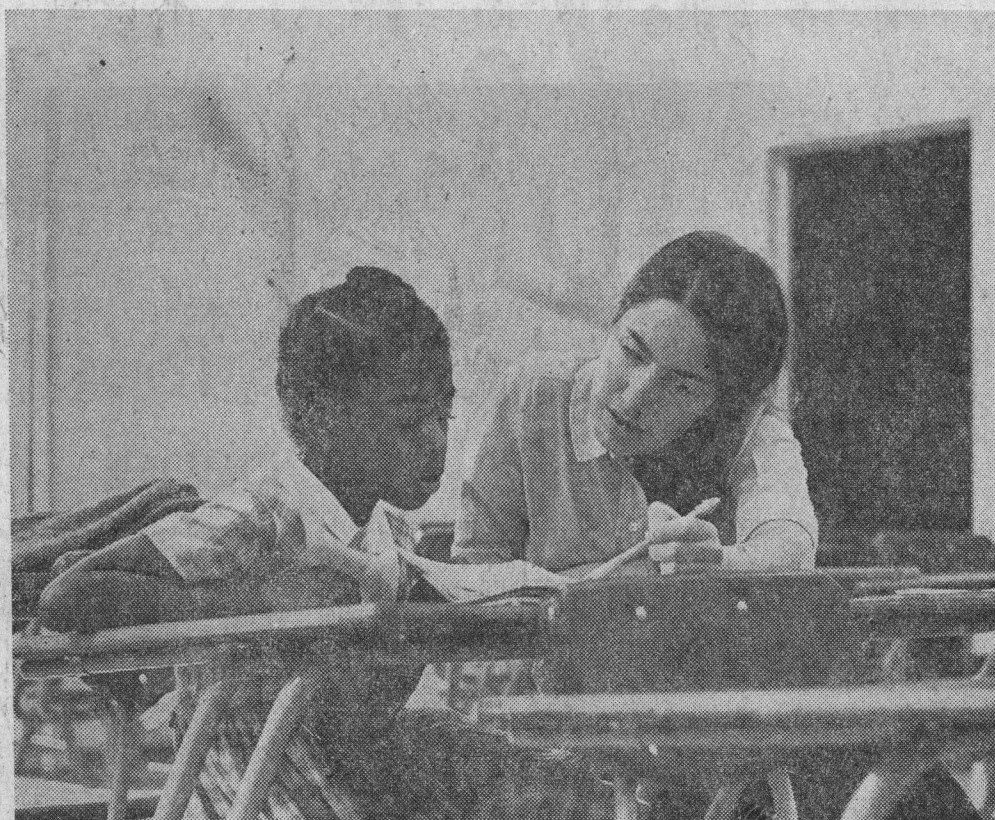
A Time for Study . . .