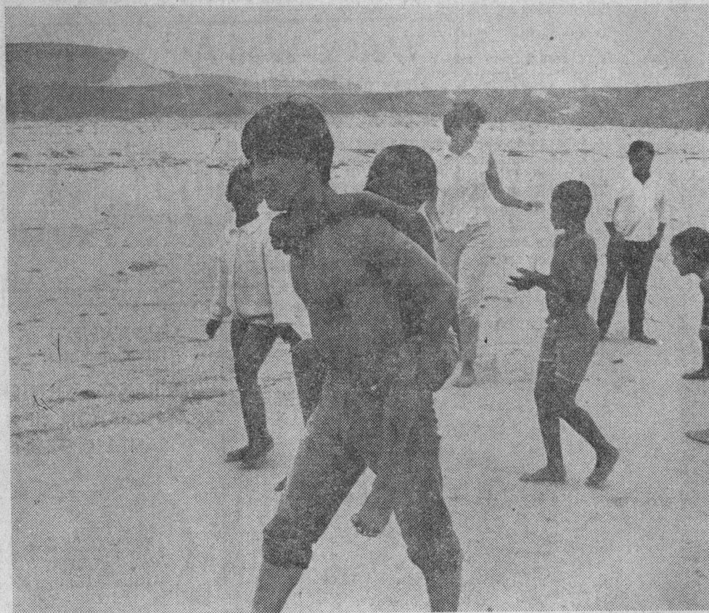
A Time for Play . . .

ment at UCSC, toss bean bags, play Bingo, throw darts, throw rings, pound nails, pitch pennies.