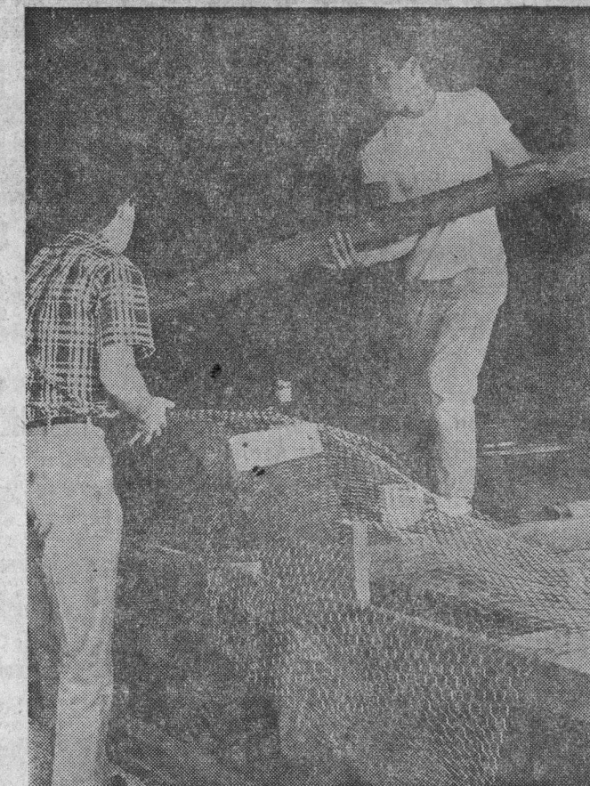
The Downtown Parade —Hurry up. Let's get this log covered before the chancellor discovers we cut down another tree. Actually, these UCSC students didn't cut down a tree. The log in hand is going into one of the floats that will parade down Pacific avenue Saturday morning to advertise The Spring Thing this weekend on campus. The parade will start at 10:30 a.m. at Maple street and Pacific and will end at the plaza.