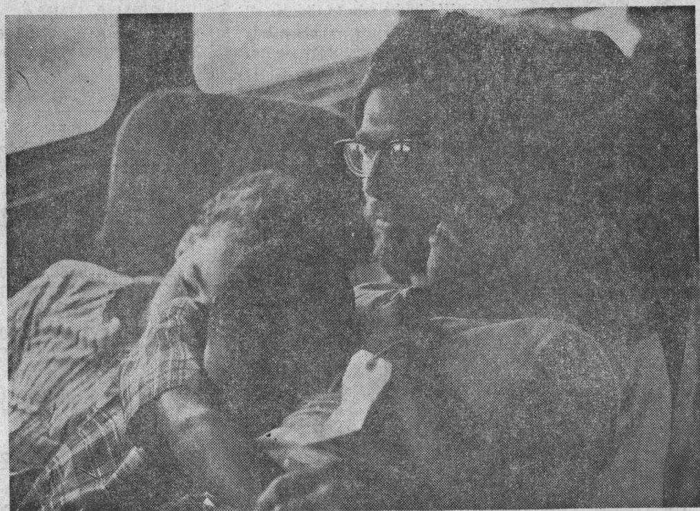
And A Time for Rest . . .

Featured band is the Jefferson Airplane, which will play three 45-minute sets. (They usually play two for 40 minutes.) They'll be backed up by two UCSC groups, the Flowers of Evil and the American Tragedy. A continuous light will be put on at the dance, staged by Captain Outrageous. The public is invited.