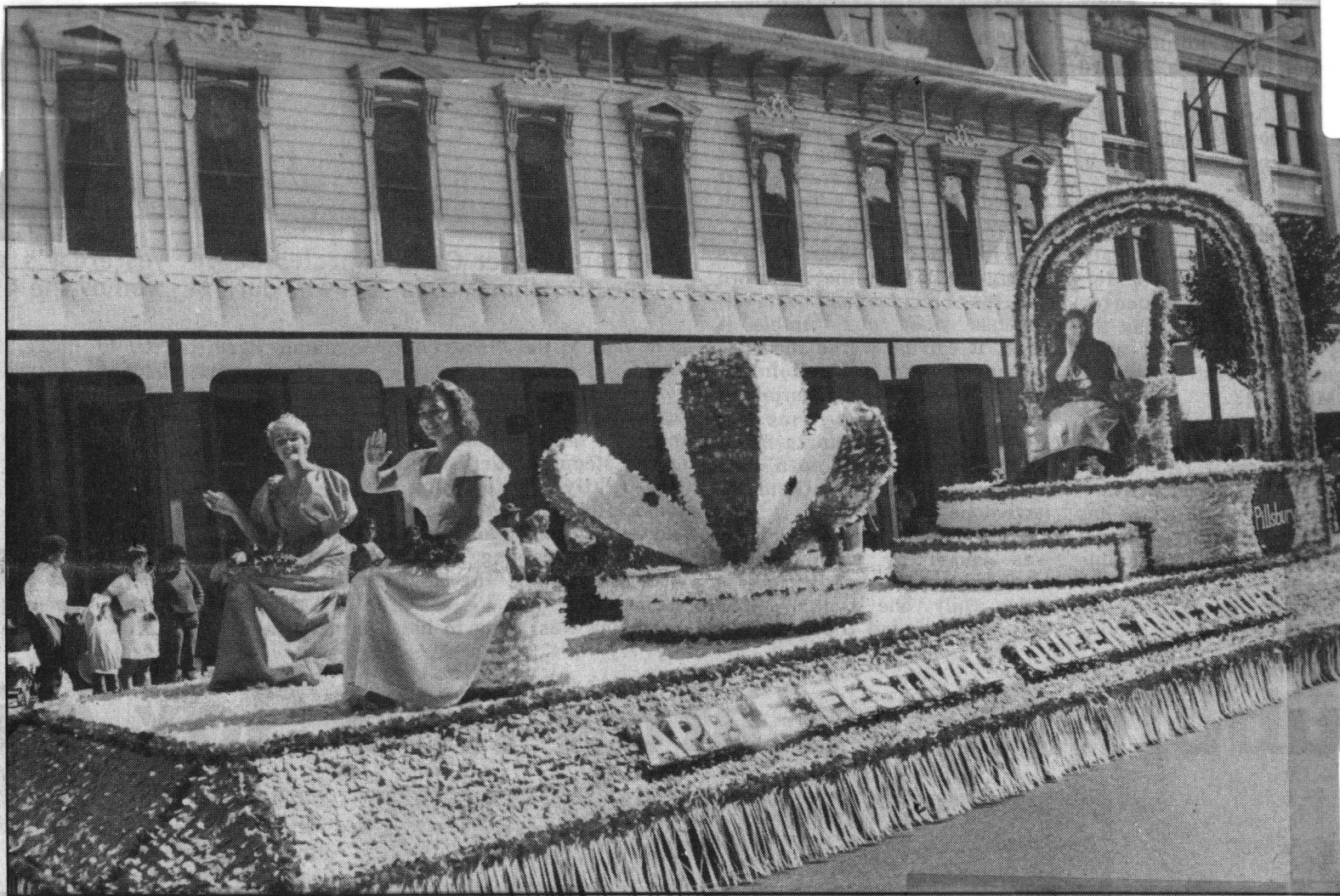
The Apple Queen float won the prize for the best professional float entry.