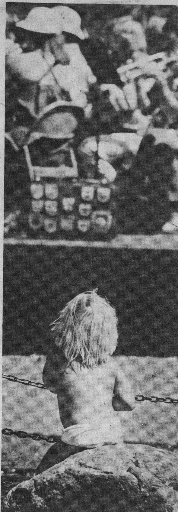
A cool kid on a warm day