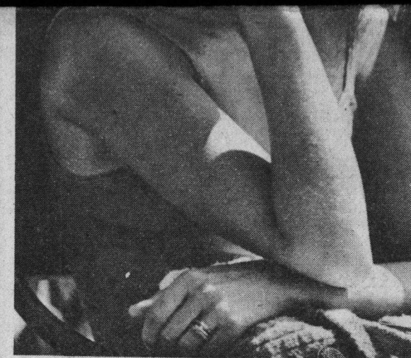
A delighted visitor, a spectator