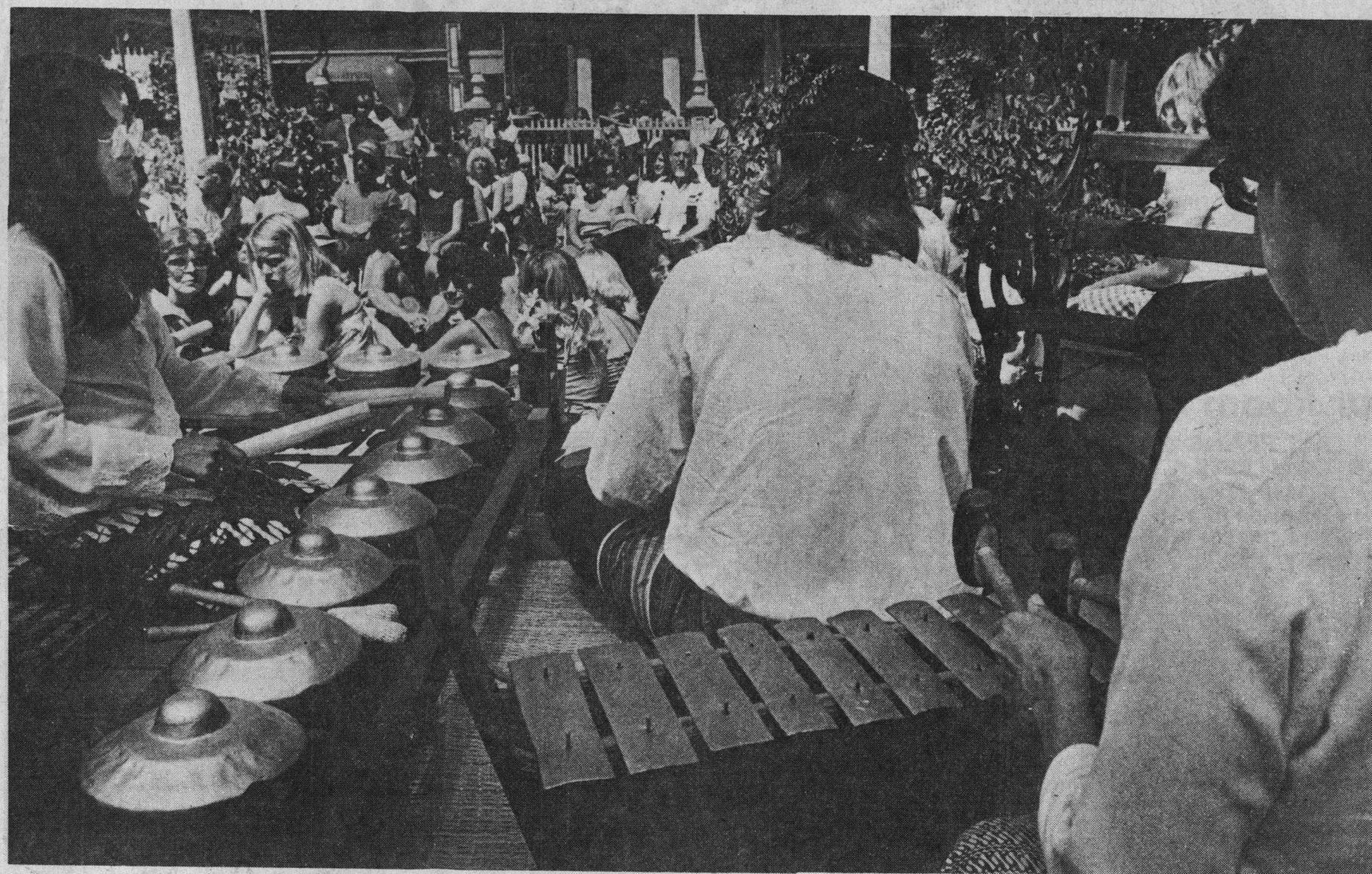
A gamelan group banged out some Lou Harrison Indonesian-like music in Abbott Square behind the Cooperhouse in Santa Cruz Saturday.