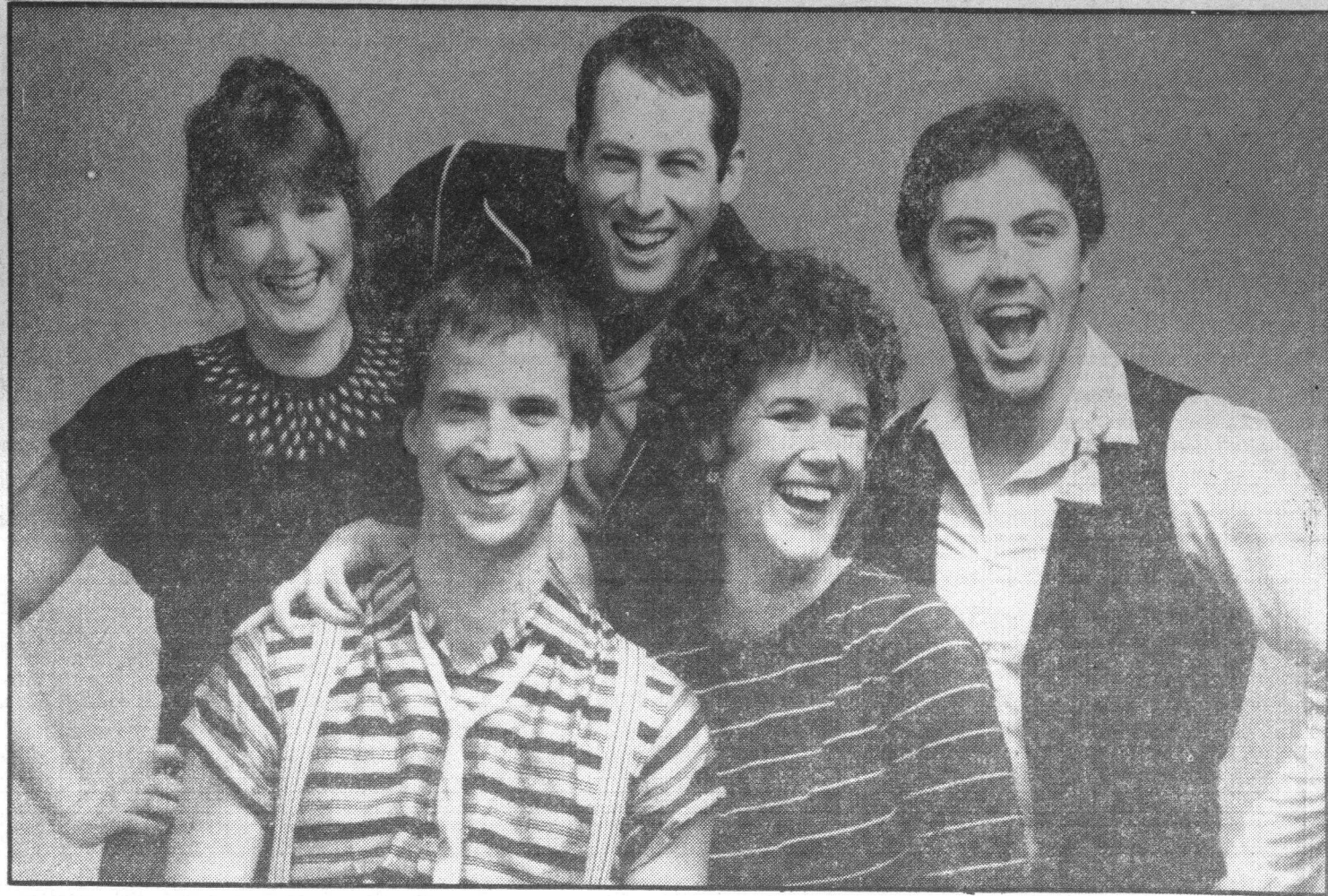
The Screaming Memes headline the SC Comedy Festival this weekend.