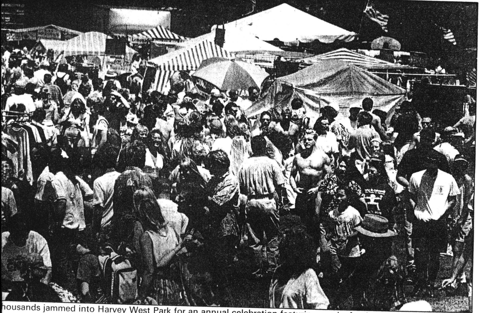
Thousands jammed into Harvey West Park for an annual celebration featuring music, food and children's games.