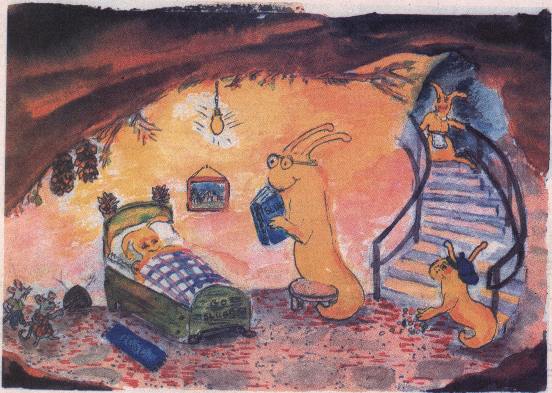
An illustration from 'Sally Slug,' a children's book to benefit UC Santa Cruz Foundation.