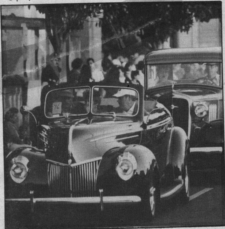
Cars from the '50s and '60s parade Saturday.