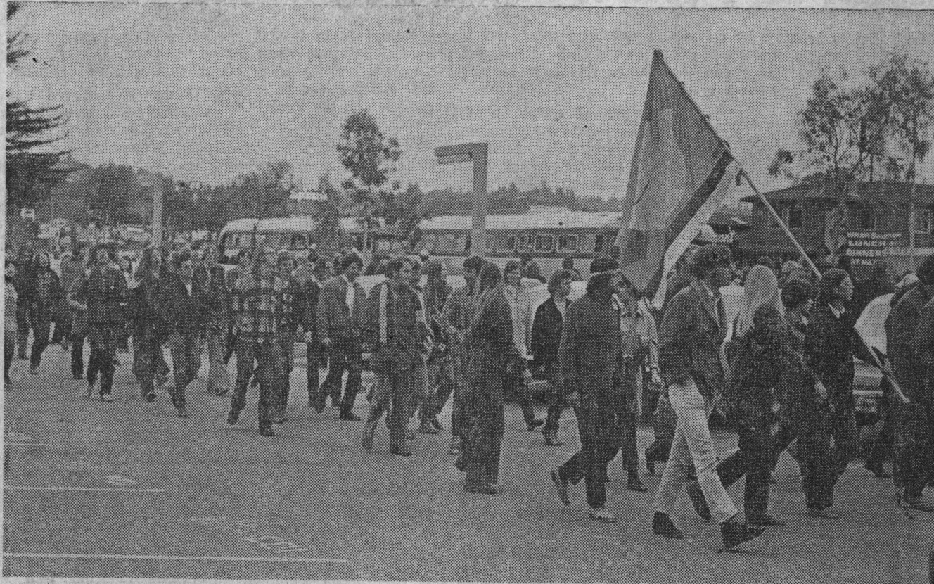
Some 400 young people march around two buses scheduled to take local men to the Army induction center in Oakland early this morning. The demonstrators halted the buses momentarily at county center until city policemen and sheriff's deputies cleared the way. No serious injuries were reported although some young people and lawmen were hurt. More protest pictures are on Page 10.