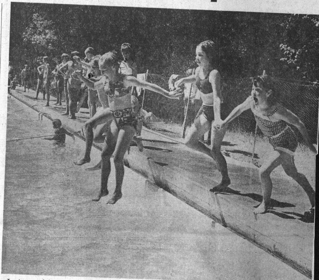
Last one in's a monkey's uncle! Swim classes at 4-H

With proceeds from Saturday's 4-H Old Fashioned Fair, leaders and members hope to make the 1966 Camp Loma sessions "bigger and better than ever."