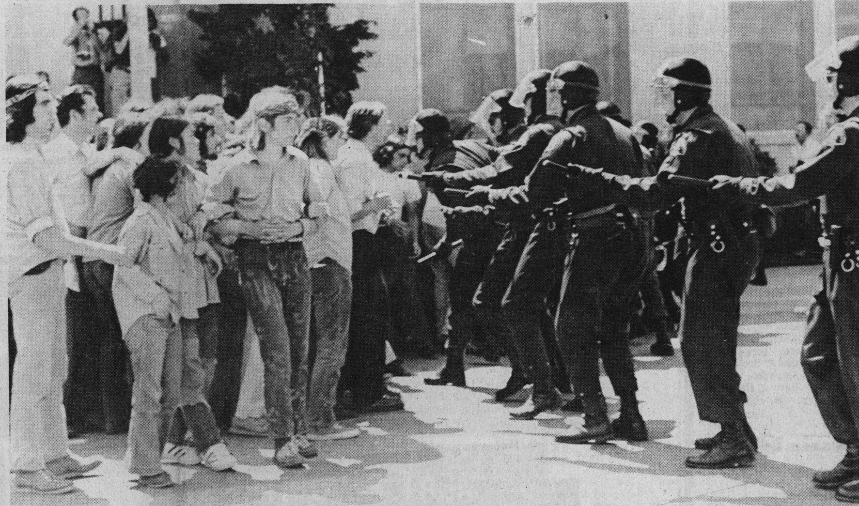
Clearing the streets

The faces of authority--showing the stress of a difficult day.