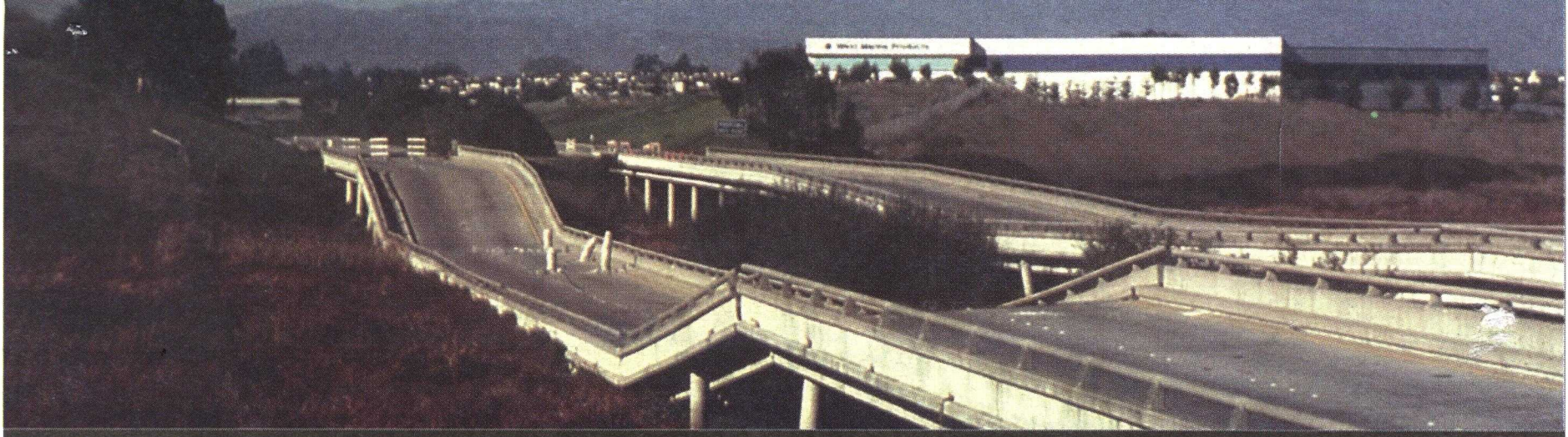
Highway 1 bridges collapsed across the Struve Slough in Watsonville during the October 1989 Loma Prieta earthquake.