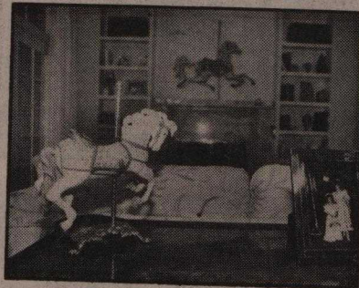
Carousel theme adds fun.

Entry to the two-level home is on the hill side, with the reception hall breaking into three staircases. One leads down to bedrooms, a plush family room featuring a grape-toned sink-in couch, and the laundry. The other two go upstairs, one rounding an open bar area into the living room and the other leading to the dining room. An opening in the dining room wall looks back and down at the entry hall. So,