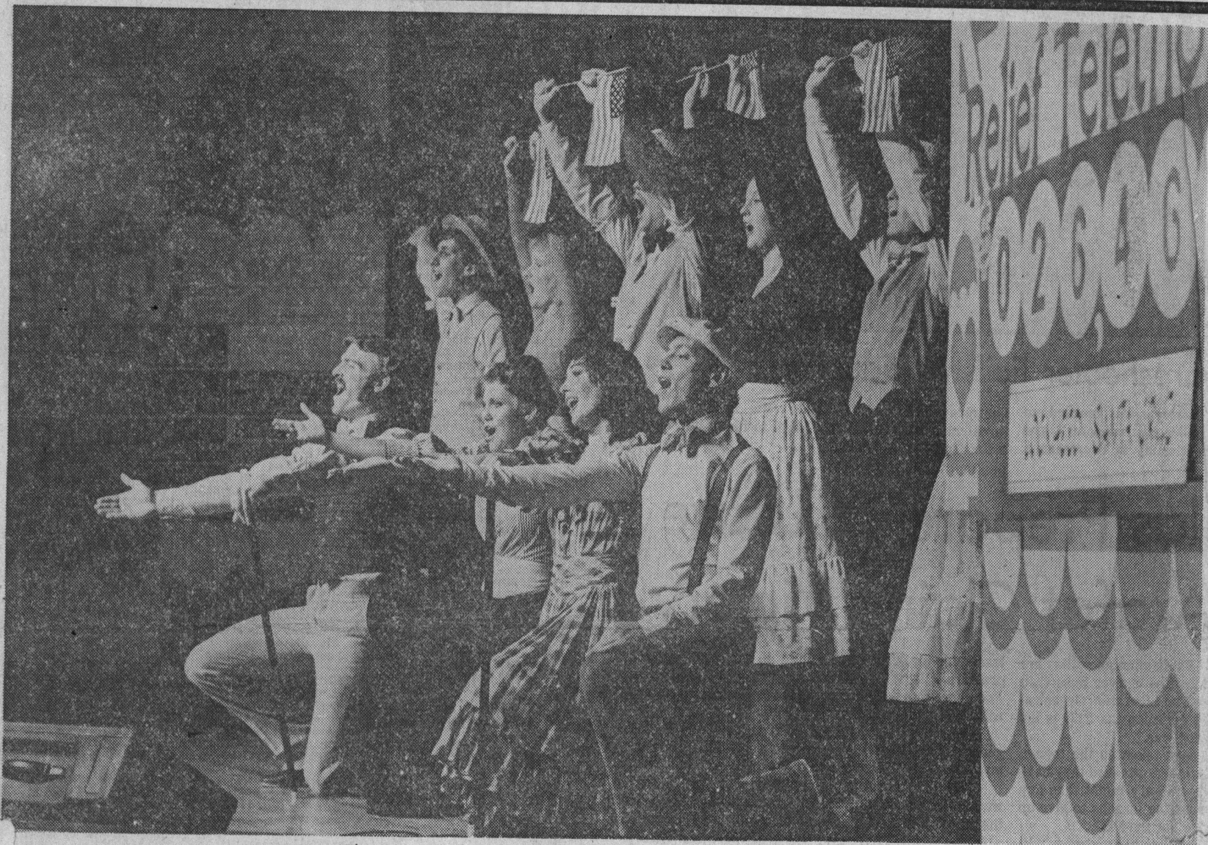
The cast of "George M!" turned in a rousing performance.