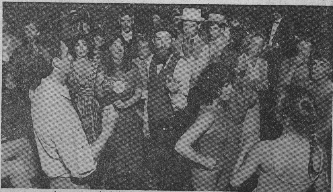
Performers readied themselves backstage at the Cocoanut Grove.