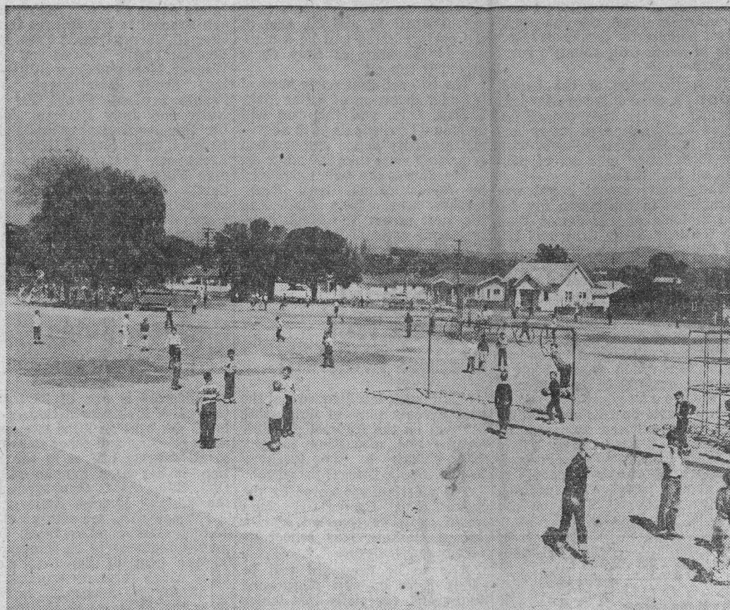
Staying well away from the Gault school building, boys and girls of Branciforte and Gault

elementary schools cover the playground during their noon-hour recreation period. Whenever classes go out to play, at