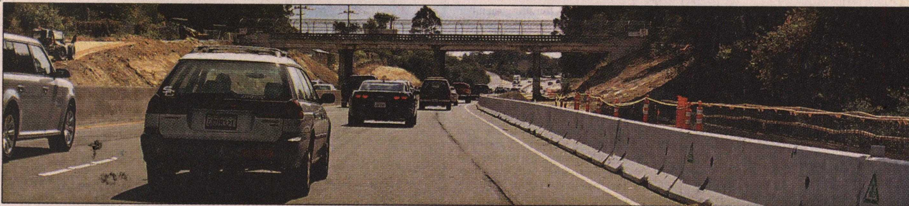
Southbound Highway 1 traffic flows under La Fonda Bridge during a moment of midday non-congestion.