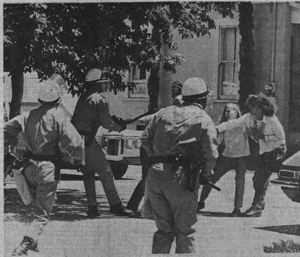
At left, a county sheriff tac squad member charges a demonstrator on Front Street in front of the county jail Thursday. In photo above, a demonstrator, hidden behind the city police tac squad member in foreground, is pulled by a policeman on