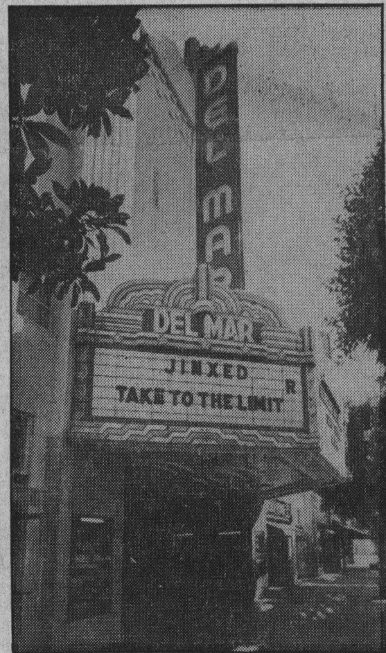
The Del Mar Theater, a classic example of movie palace moderne, was one of the award winners at the Santa Cruz Historical Society's annual award dinner.