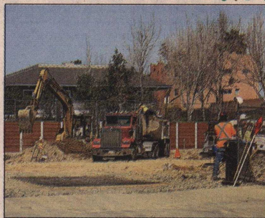
A $25 million Hyatt Place hotel is being constructed on Broadway a block from Ocean Street in Santa Cruz.