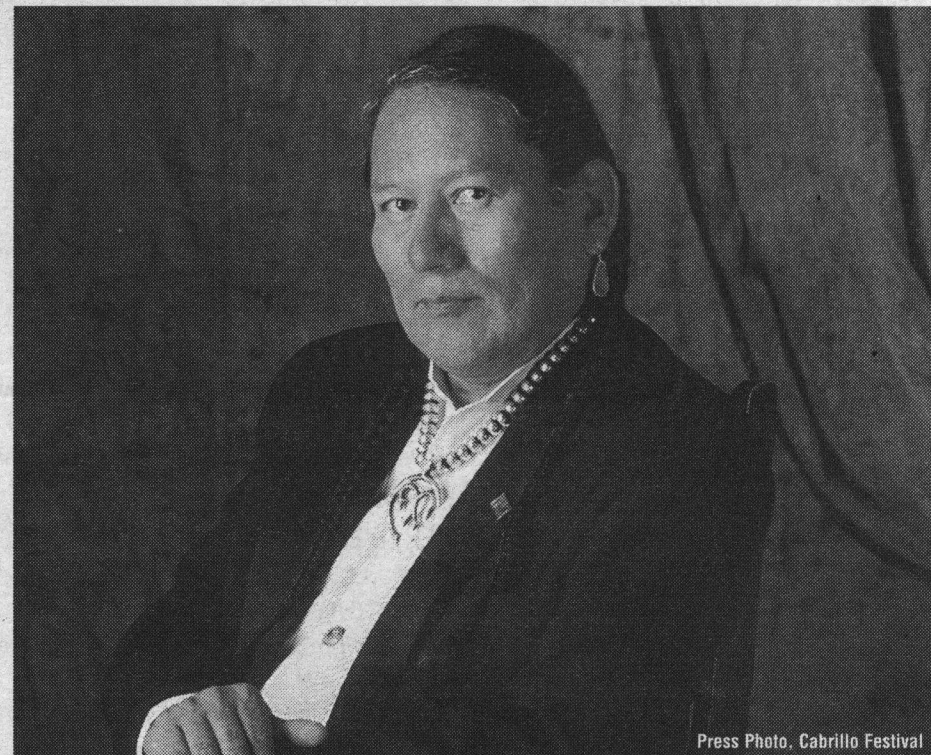
Press Photo, Cabrillo Festival