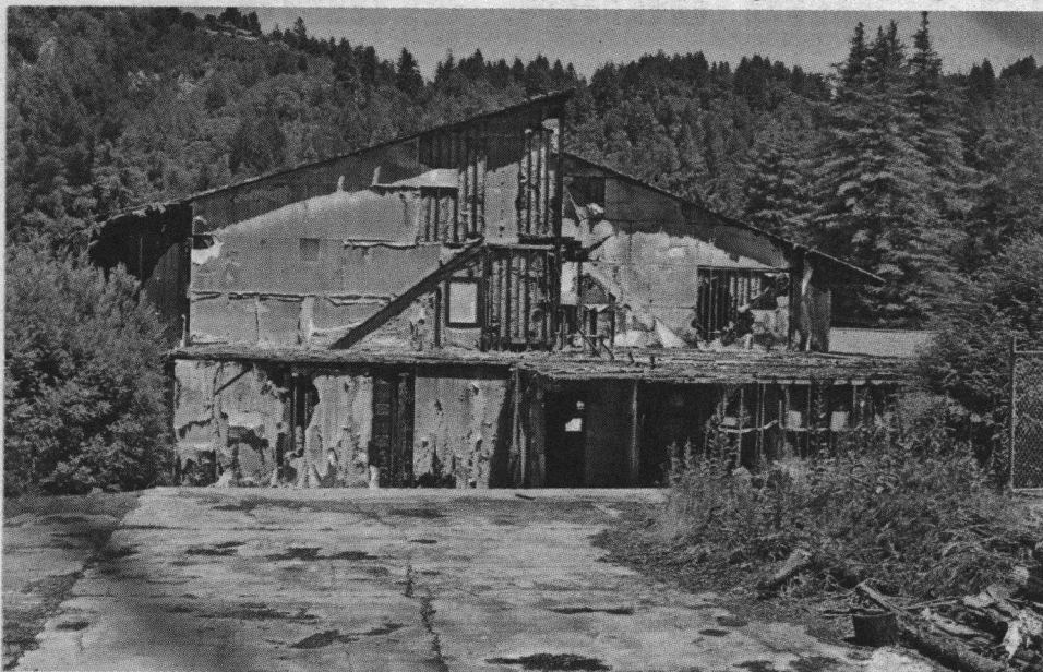
The burnt southern part of the Brookdale Lodge complex will be torn down under the new ownership.

As the restoration progresses, he said that he would like to highlight the long and storied history of the Lodge and plans to create tributes to the events, people, and stories that the establishment has had a role in.