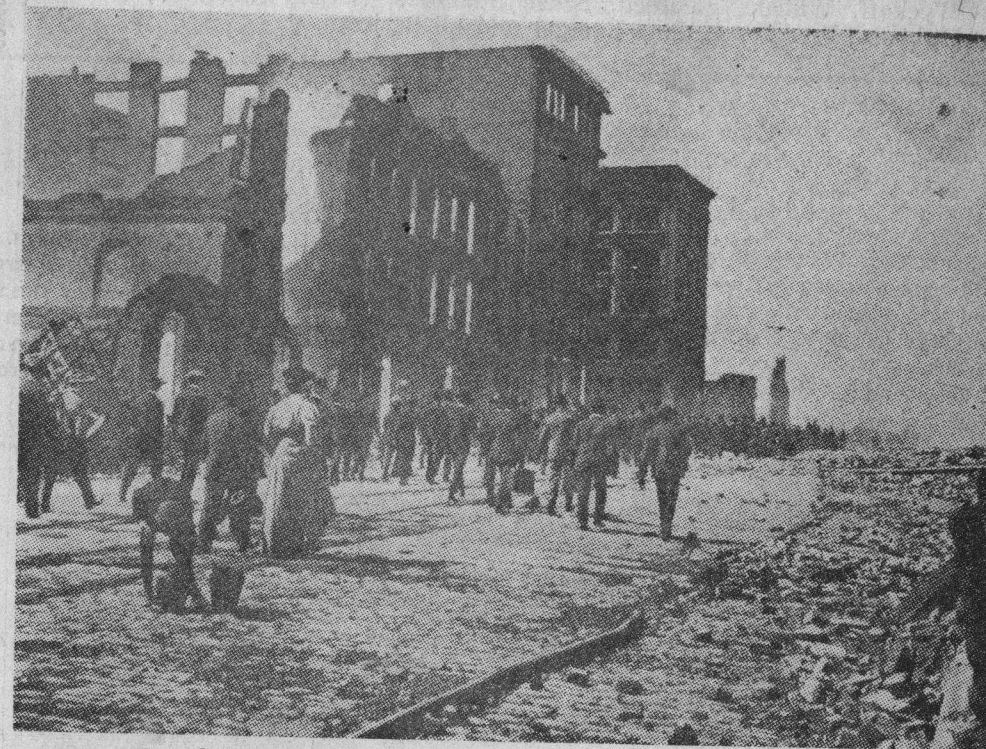
Bread lines formed in San Francisco's ruined streets.

in a world gone thick jumble of trees all ern Santa Cruz county. For called the "Crazy Forest."