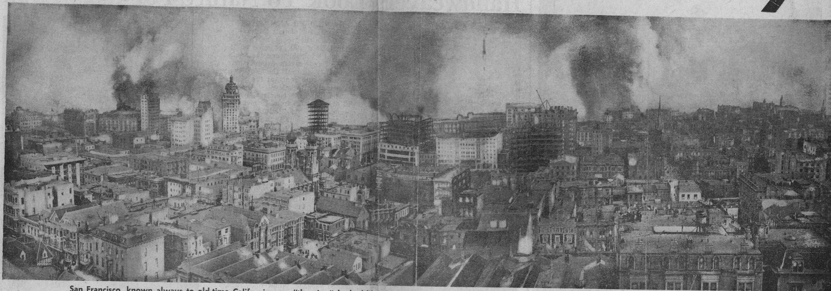
San Francisco, known always to old-time Californians as "the city," looked like this just before the debacle. Every building in this panoramic photo was either leveled or gutted.