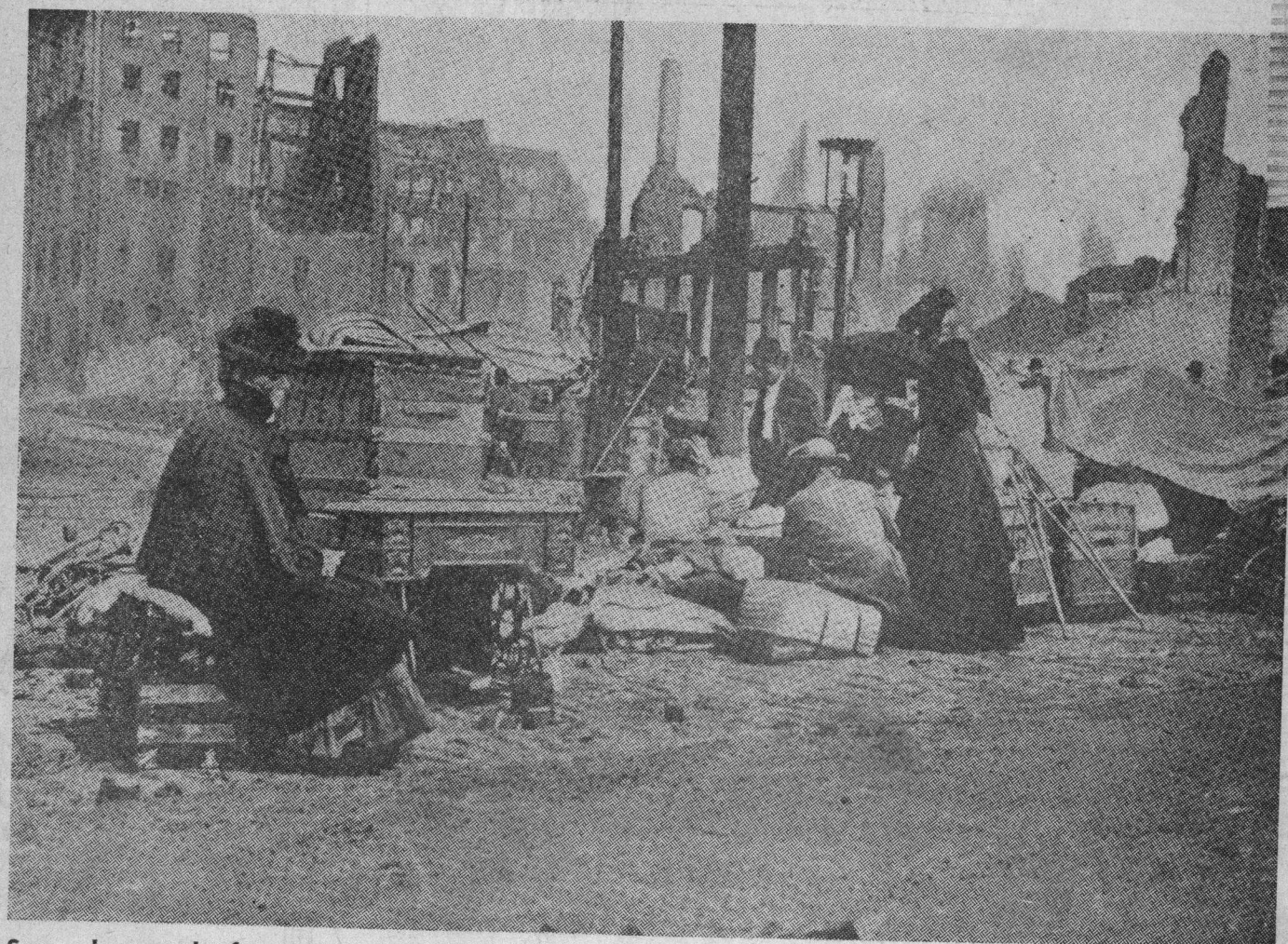
Some clung to the few possessions they were able to save . . . a sewing machine, pair of crutches, trunks.