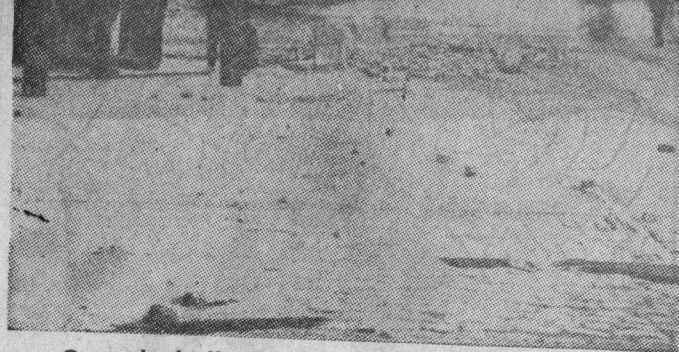
Gutted shells, looking down Third street.