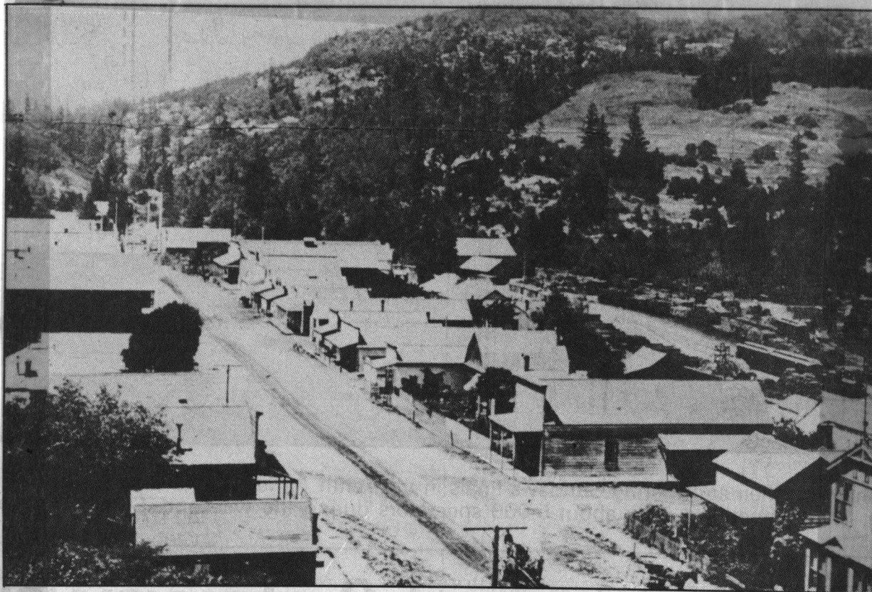
Santa Cruz County Historical Trust