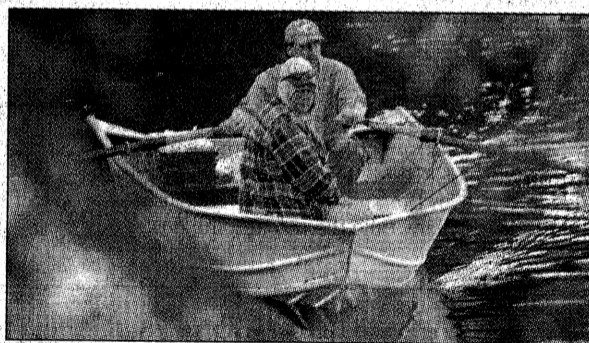
A pair enjoy a quiet row in a Loch Lomond cove last week.

DETAILS: 335-7424 or http://www.ci.santa-cruz.ca.us/wt/llra/llra.html . Information line at 420-5320.