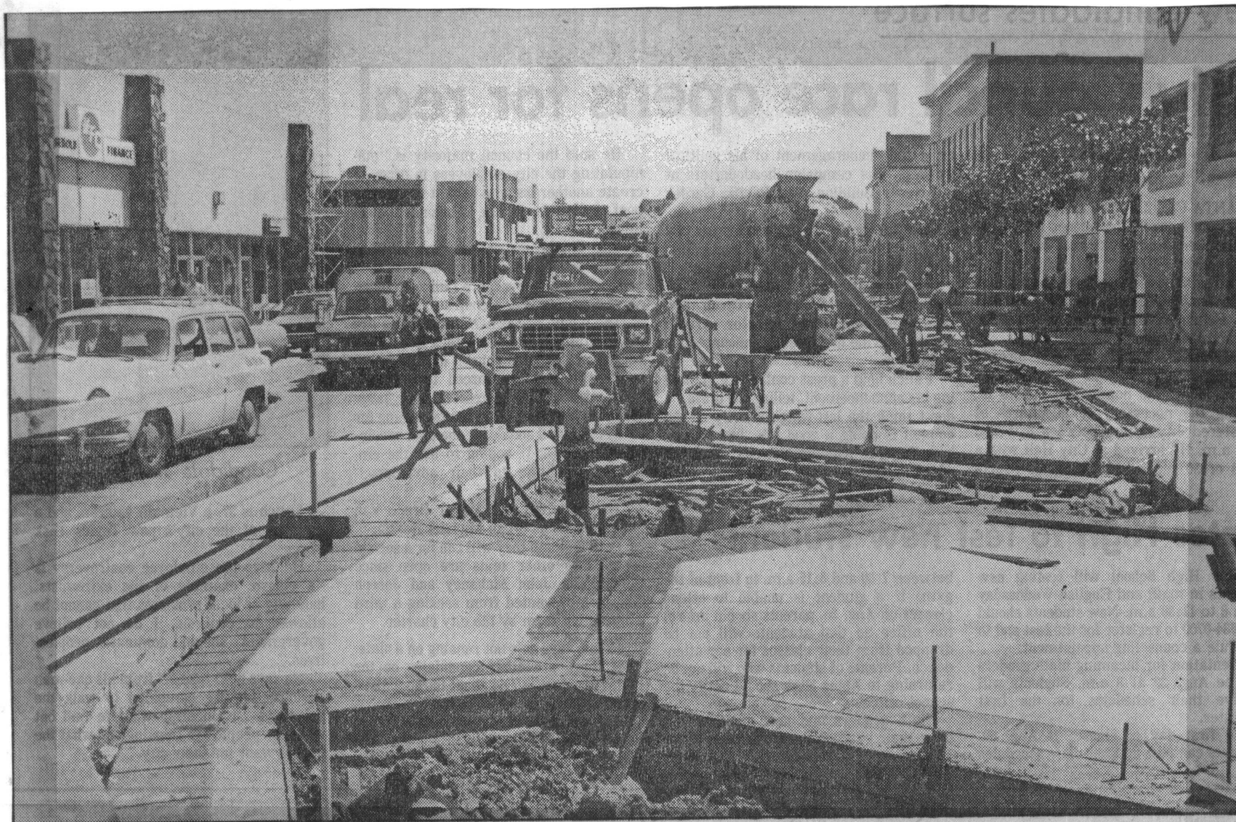
There's a new look to Pacific Avenue south of the current Pacific Garden Mall.