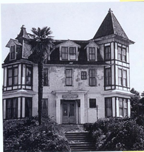
The Hotel McCray on Beach Hill (Santa Cruz) inspired Hitchcock's design of Norman Bates' home in Psycho .