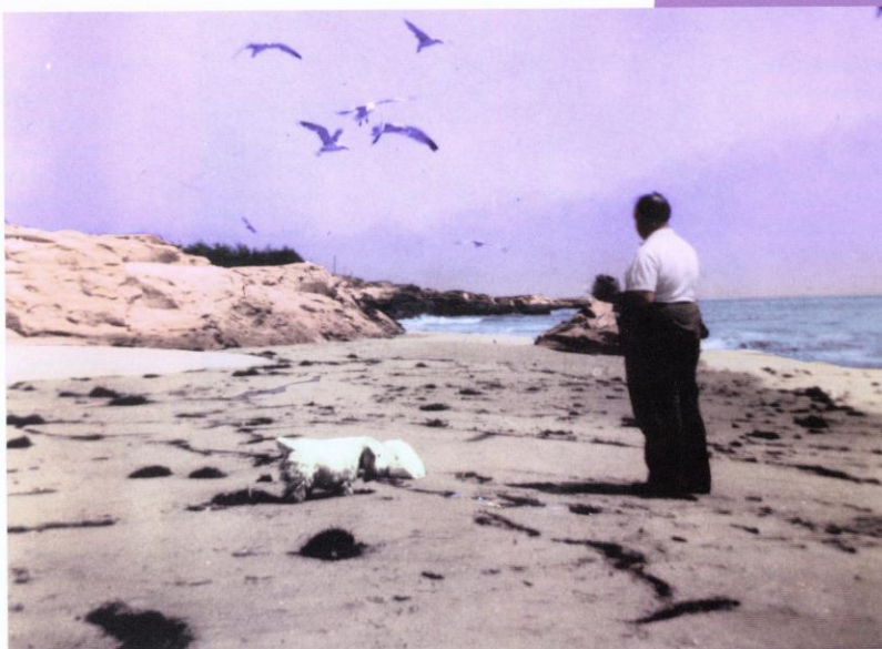
Alfred Hitchcock walking on a Santa Cruz beach with his beloved Sealyham Terriers.

that Northern California serves as a central character in Vertigo , vying for equal billing with Stewart and Novak.