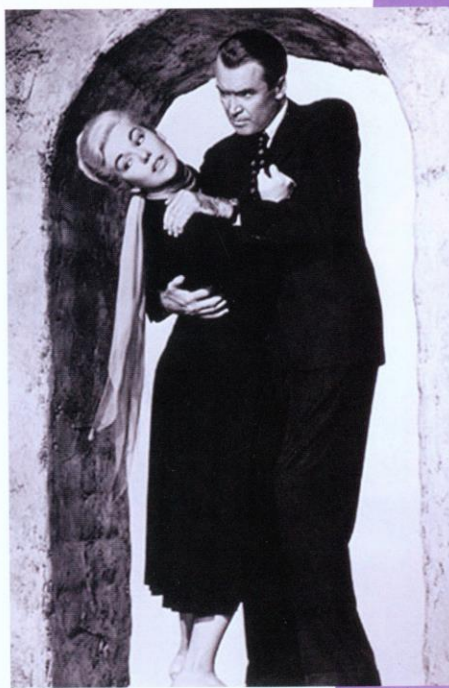
(Above) Jimmy Stewart and Kim Novak struggle in the Mission tower in Alfred Hitchcock's 1958 thriller, Vertigo .

While somehow managing to avoid military service during World War I, Hitchcock didn't miss out on the fear and horror it engendered throughout Great Britain. To escape, he lost himself in the paintings of British masters and took up the burgeoning art of photography. He soon found work as a title-card designer in the embryonic British film industry, and by the time he was 25, he had worked his way up to the position of director at Gainsborough Studios. His second film, a thriller, The Lodger: A