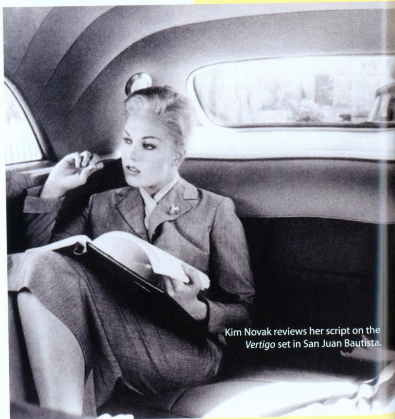
Kim Novak reviews her script on the Vertigo set in San Juan Bautista.

With his 1943 classic, Shadow of Doubt , Hitchcock directed his first film set entirely in Northern California. And while