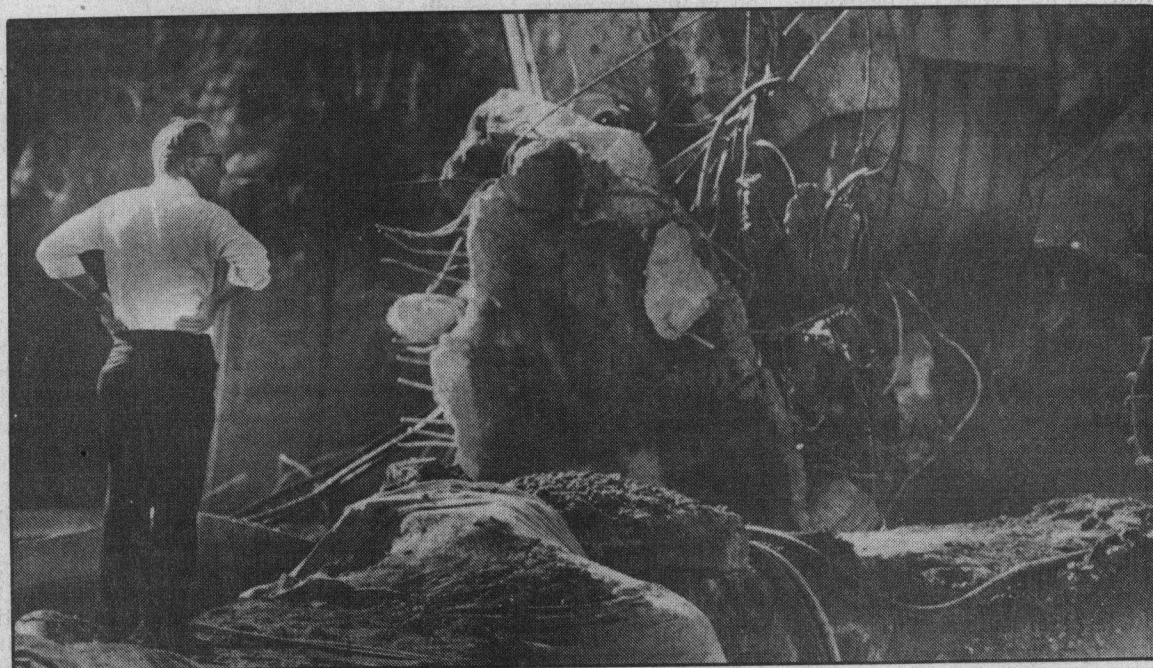
An onlooker watches as another shovelful of the bridge begins its journey to the city dump.

The replacement bridge will be four lanes wide and is expected to be completed in about a year.