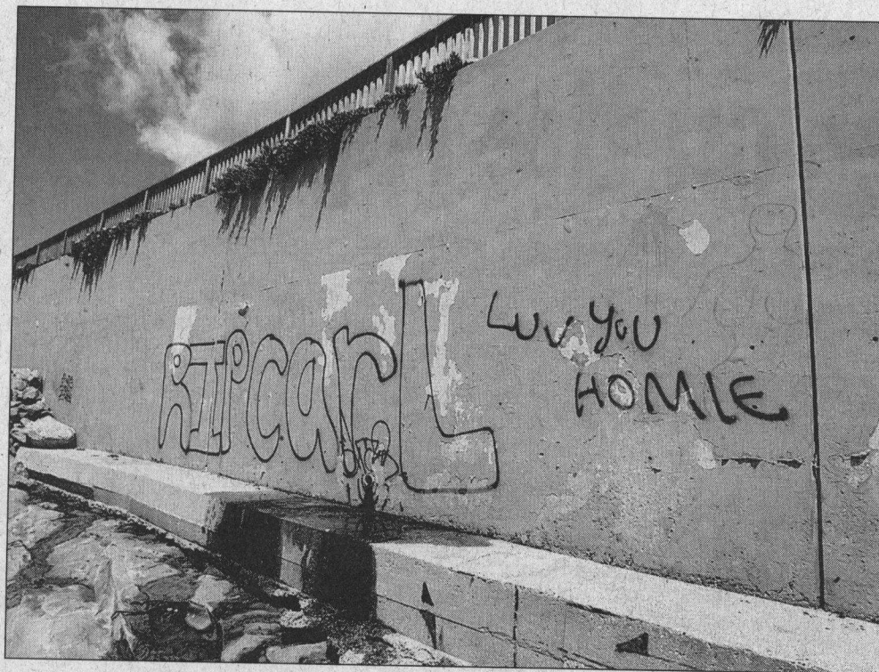
Carl Reimer's name shows up in a painted tribute on a West Cliff Drive wall.

Surenogangs, which claim the color blue and No. 13, formed at Santa Cruz High and in the Beach Flats neighborhood as early as the 1970s, when the children of Mexican immigrants banded together to defend themselves against the taunting of local kids,