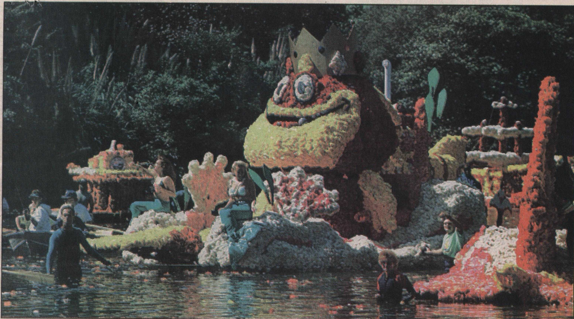
The "Kingfish" float won the President's Trophy during the 1989 Capitola Begonia Festival.