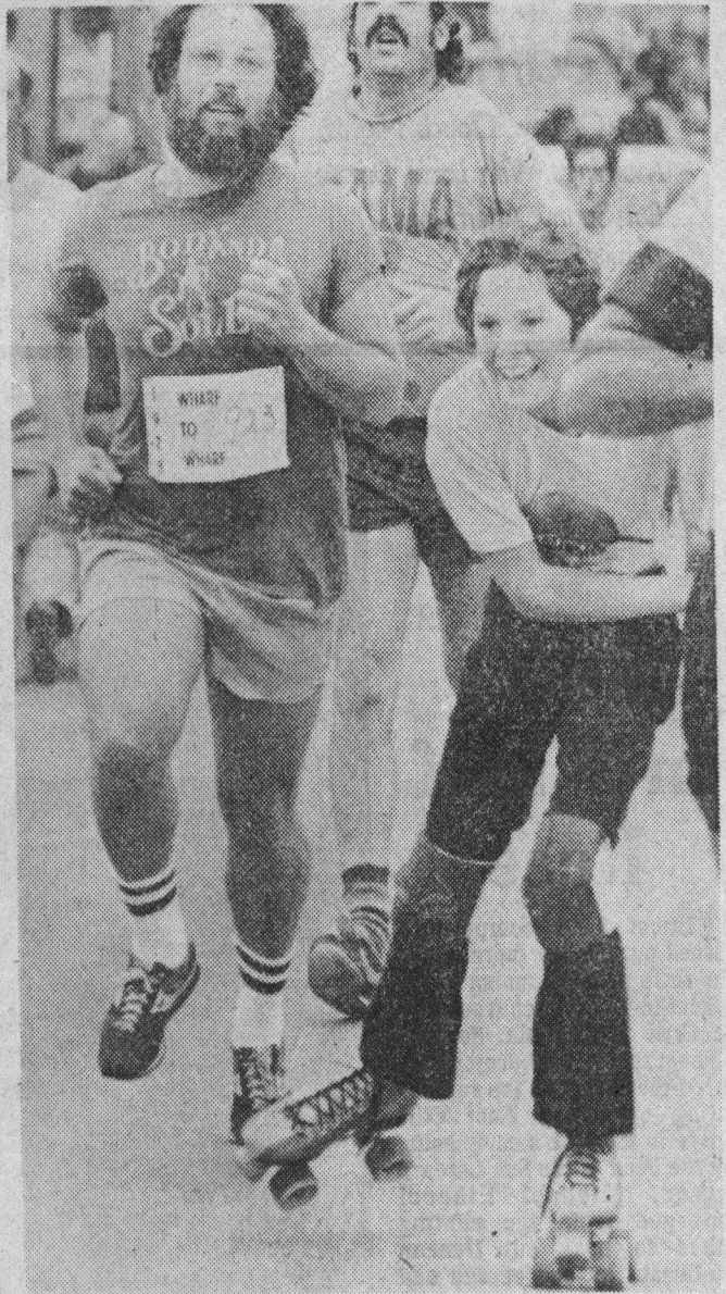
An unofficial entry rolls toward home