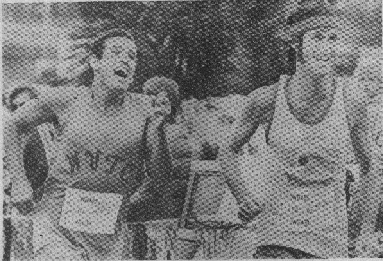
A sprint at the finish for 200th place.