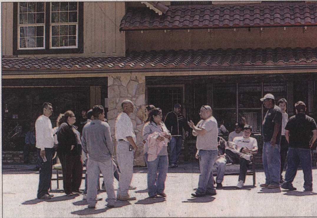
Brookdale Inn & Spa residents displaced by Tuesday's fire gather Wednesday to discuss where they'll go.